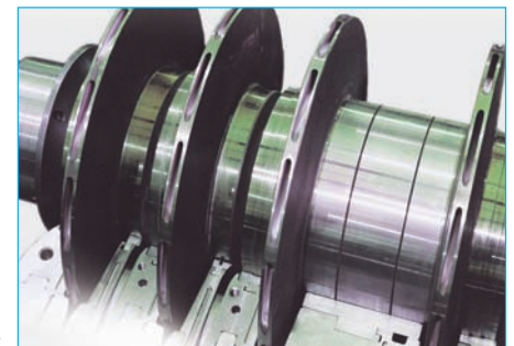
Compressor rotor details