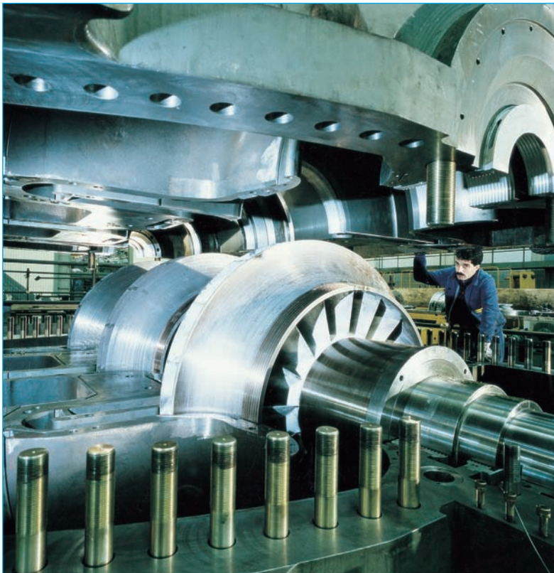
Large horizontally split compressor

Tilting-pad journal bearings: this type of bearing improves the dynamic performance of the rotor and drastically reduces instability phenomena induced by lubricating oil. These bearings demonstrate lower spare parts cost, since only the tilting pads and not the bearing housing need to be changed. This system also allows better temperature monitoring, because the tilting pads can be easily equipped with thermocouples. Benefits include reduced lubrication, reduced parasitic power losses and lower bearing temperatures.