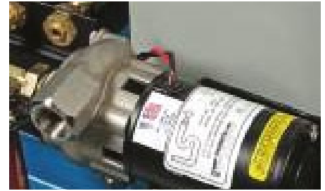
Heat trace booster pump (optional)

Our experts can assist with all of your operating and maintenance requirements. Visit www.geoilandgas.com/lufkin to locate a service technician near you.