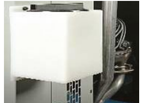
Large radiator reservoir (optional)