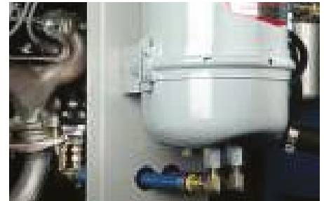
Luberfiner oil filter (optional)